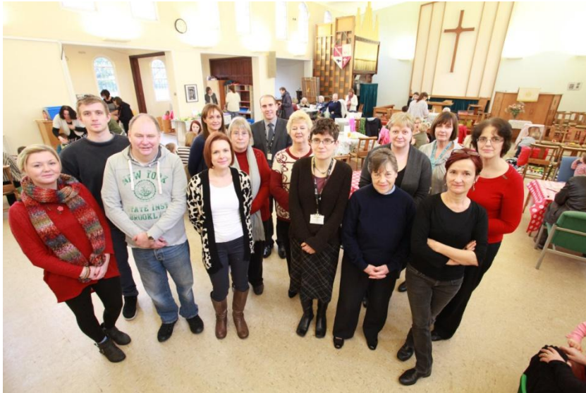
Community Centre event: